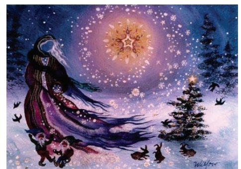
Mid Ohio Atheists

Bring a covered dish and whatever you wish to drink. Turkey and ham will be provided. Just ask one of the members if you need directions.