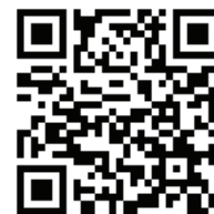
QR Code for midohioatheists.org